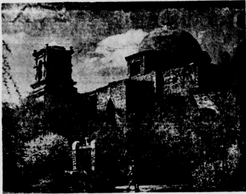
SAN JOSE MISSION STATE PARK AND NATIONAL HISTORIC SITE surround this historic church at the edge of San Antonio. The mission has so great a part in history that it is the only designated national historic site in Texas. Beside this old structure, with its beautifully carved stone facade and its famed rose window, the mission restoration includes the defense walls, the granary, quarters of priests, civil authorities, military forces and Indian converts. The restored grist mill is said to have been the first industrial plant in the state.