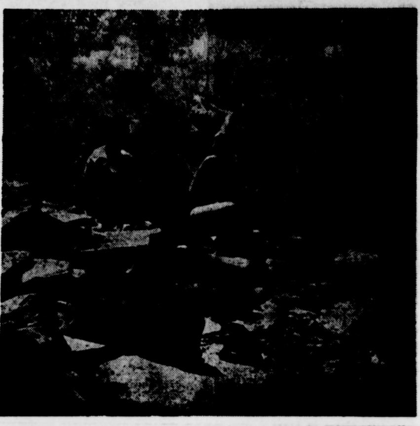
POSSUM KINGDOM STATE PARK won a place in internationally circulated Travel magazine with this picture of skin divers at the park. Park Road 33 leads to the park from U.S. Highway 180 at