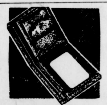
Billfolds Many styles in quality leathers.