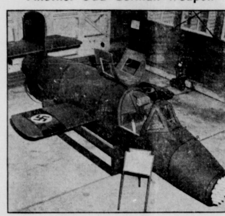
This is a Nazi jet propelled interceptor, designed to be launched from a vertical platform to meet oncoming bombers. After firing of 24 nose rockets, pilot and propulsion unit were to be parachuted. The plane was shown to the public by the Air Technical Service Command at Freeman Field, Indiana.