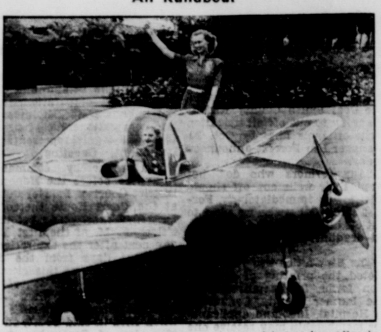
The "Ensign," a new air runabout, makes its debut at Long Beach, Calif. Built by All American Aircraft, it is a two place, low wing monoplane in the $3000 class, with 500 mile range, 112 m.p.h. cruising speed, and 13,500 foot service ceiling.