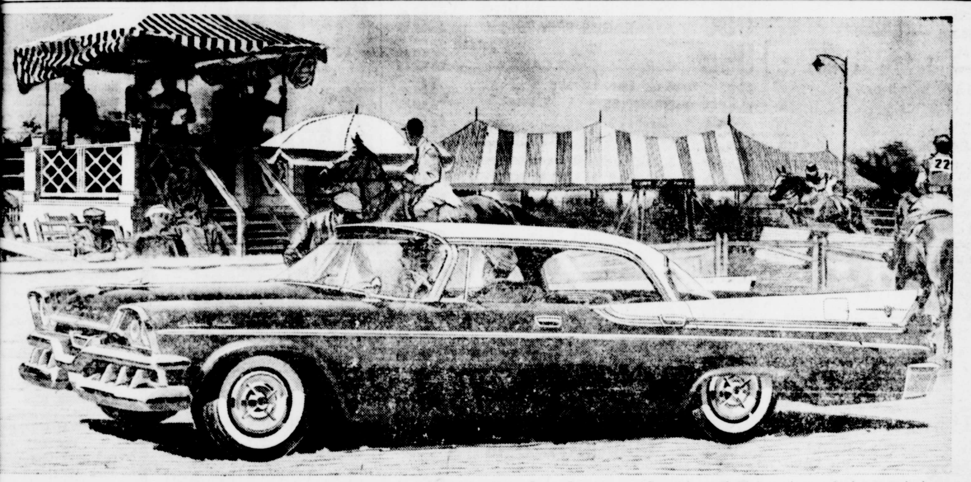
Swept-Wing Dodge Custom Royal Lancer 4-Door-the car that brings adventure back to motoring!

Step into the wonderful world of AUTODYNAMICS