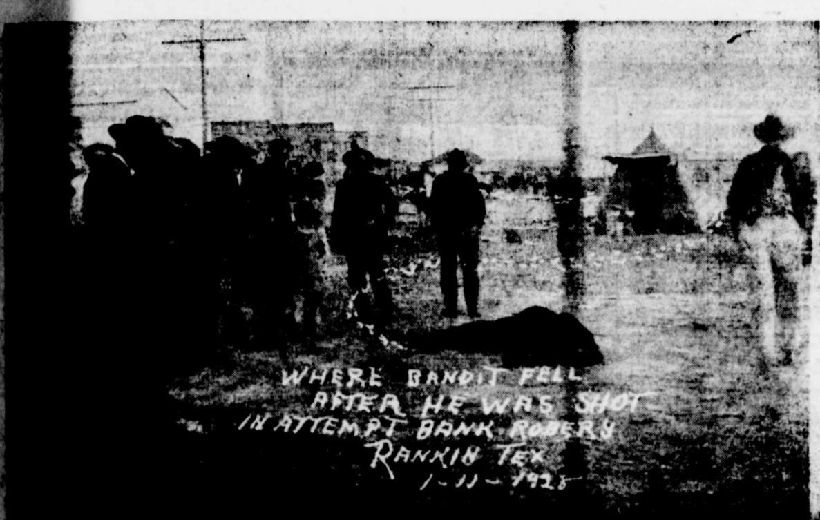
THE ATTEMPTED BANK ROBBERY in Rankin, January 11, 1928