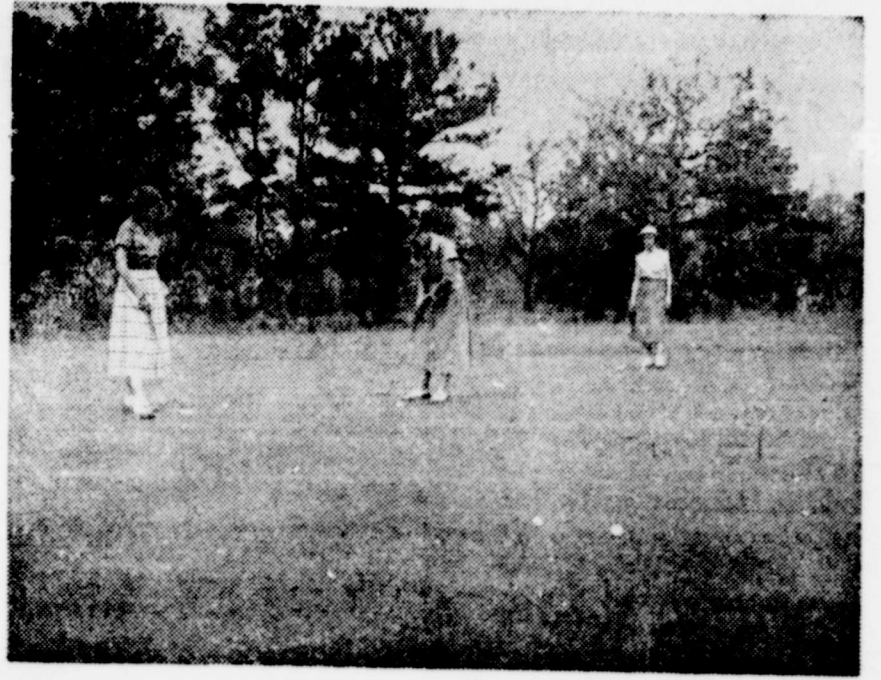
BASTROP STATE PARK has among its attractions the Lost Pines golf course where players find beautiful scenery as well as sporty course with a good water hazard. The park is at the junction of Texas Highways 21 and 71 about one mile east of Bastrop, Texas.

For a complete line of office supplies, prompt commercial job printing and advertising service, contact the Rankin News.