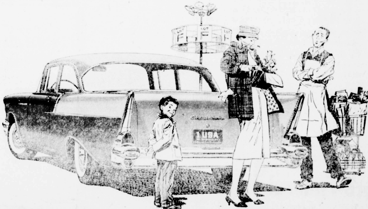
The "One-Fifty" 2-Door Sedan with Body by Fisher—one of 20 beautiful new Chevrolets for '57! AIR CONDITIONING—TEMPERATURES MADE TO ORDER—AT NEW LOW COST. LET US DEMONSTRATE!