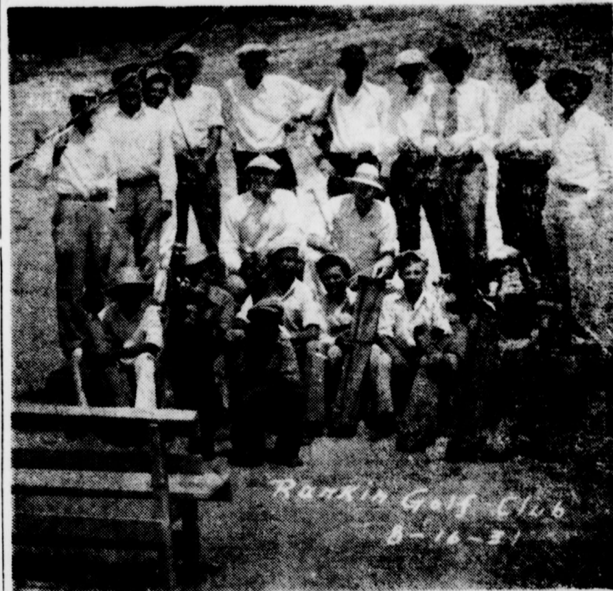
THE RANKIN GOLF CLUB OF 1931

... was composed of a young bunch of sports