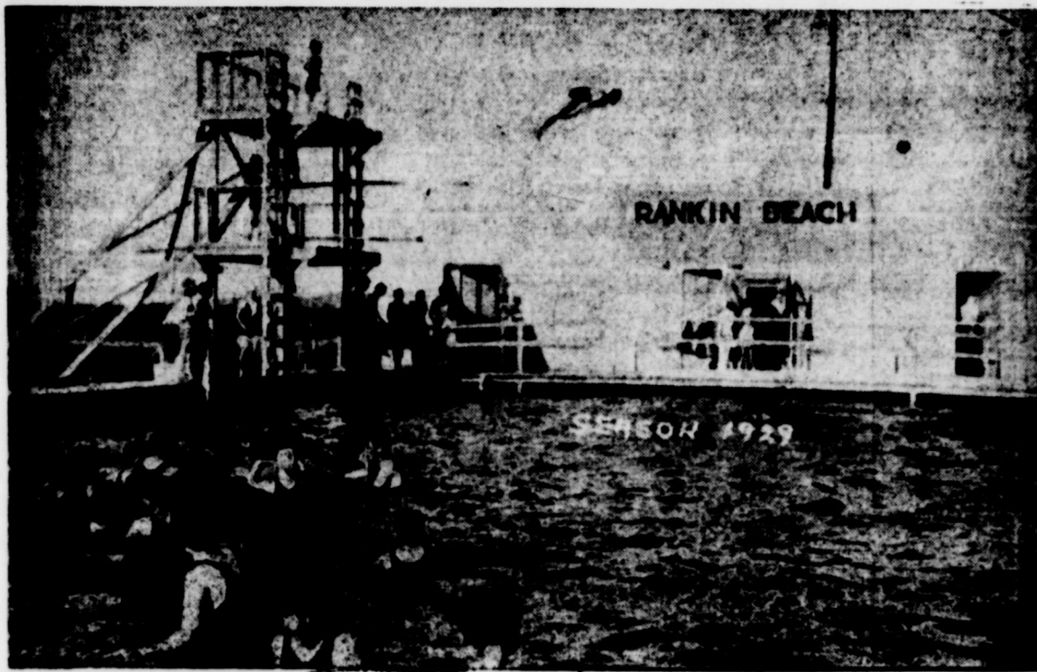
The Rankin (Tex.) News — Thursday, January 17, 1957