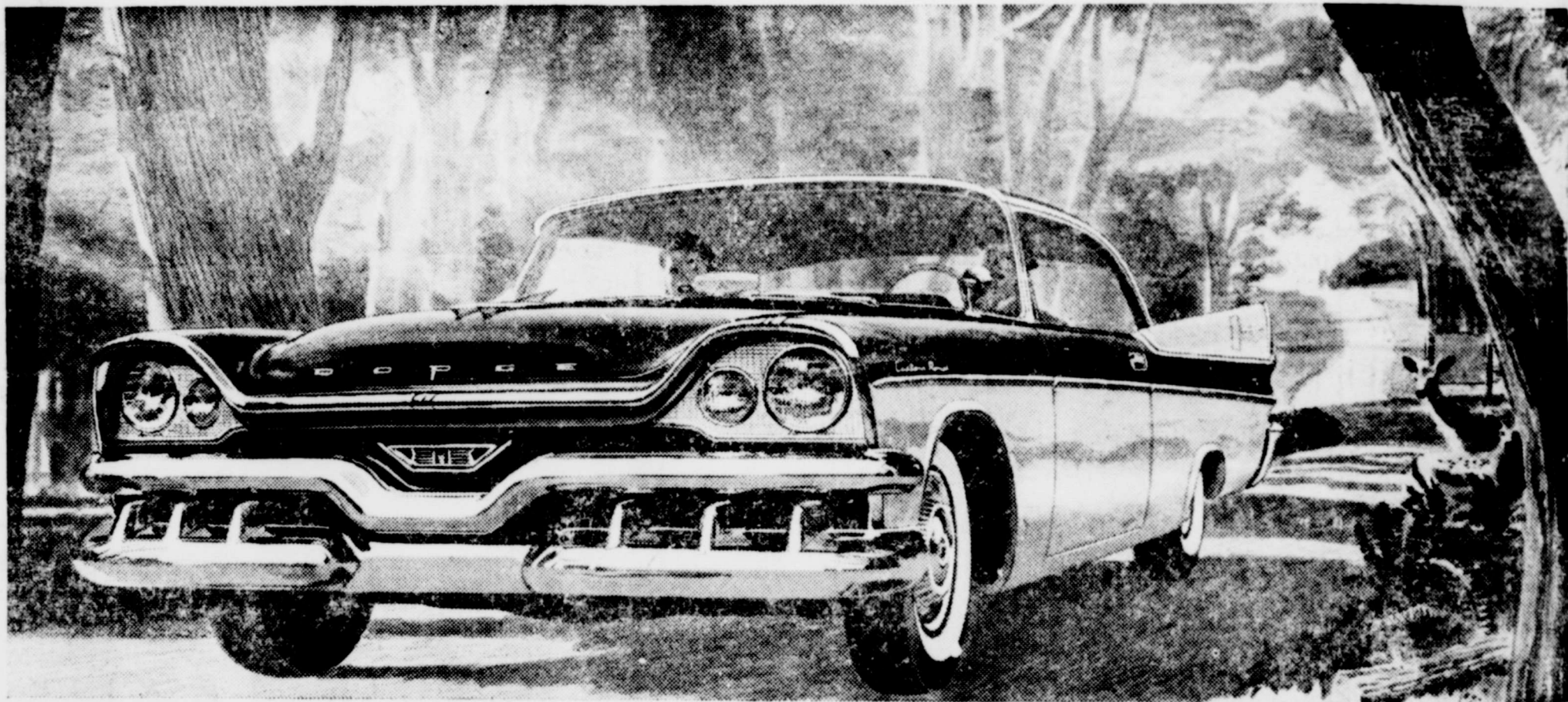
Swept-Wing Dodge . . . only 4½ feet low and all dynamite!

ter Motor Co., Pauley Feed Epley, Fisher Drug, Car Service, News Publishing Co., Lingo Lumber, Wallace Jew McCamey Lions Club.