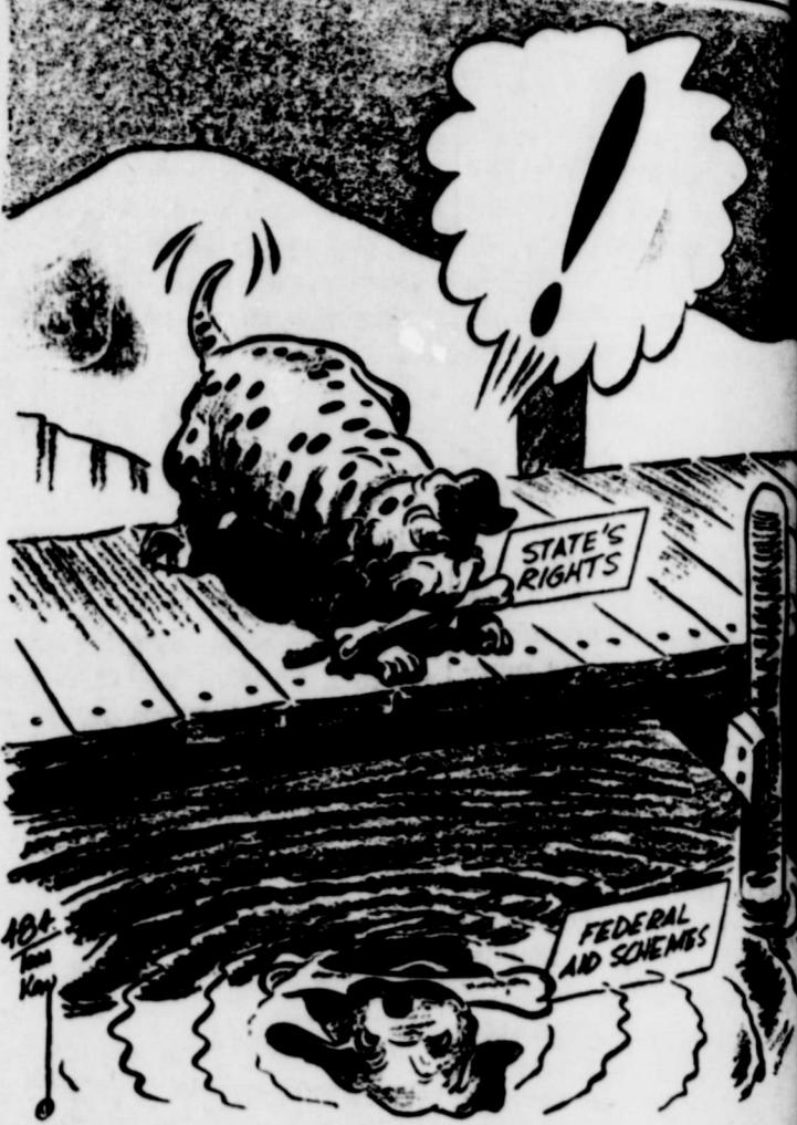
"Beware Lest You Lose the Substance by Grasping at the Shadow." - Aesop