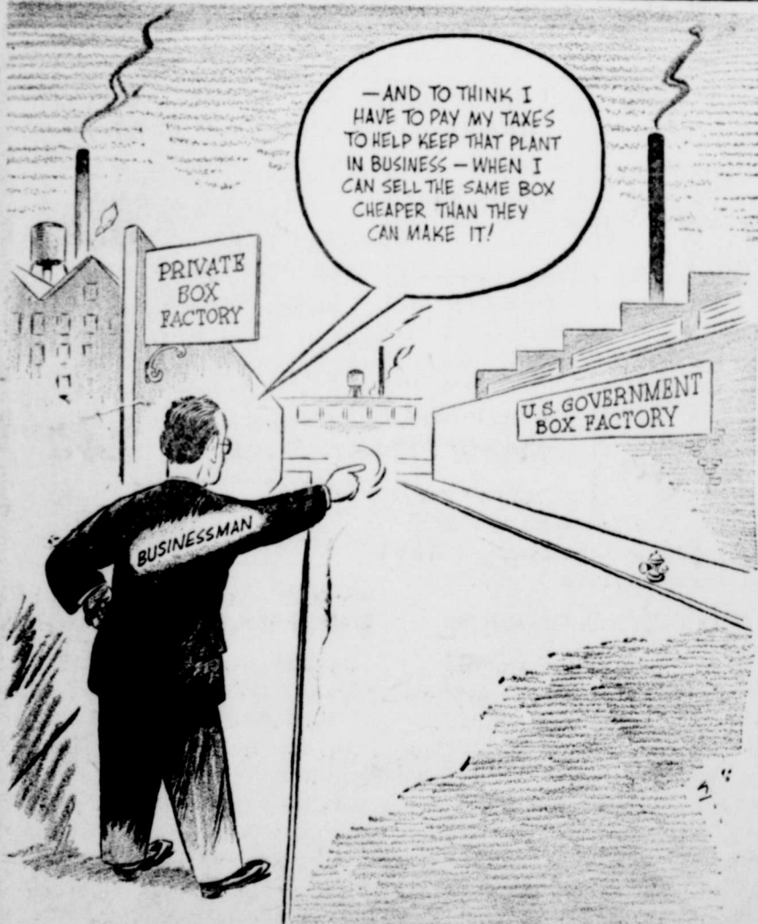
Ridiculous, to Put It Mildly