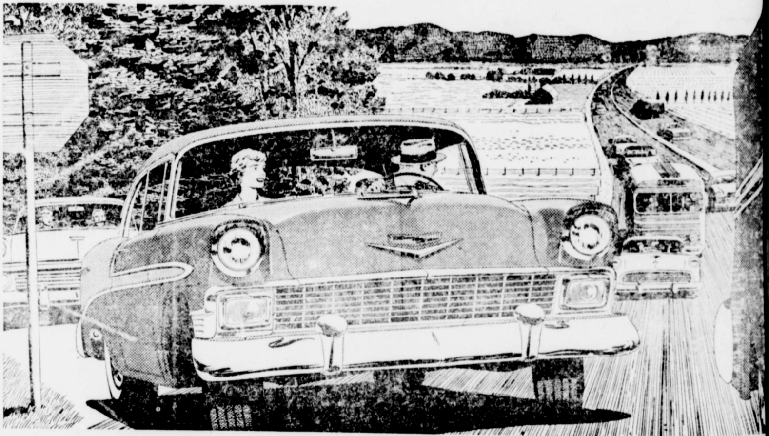
THE BEL AIR SPORT COUPE—one of 19 high-priced-looking Chevrolets, all with Body by Fisher

Soft-spoken, yes. (One reason is the hydraulic-hushed valve lifters now in all Chevrolet engines—V8 or 6.) And this handsome traveler packs a horsepower wallop that ranges up to 205! It's charged with sheer, concentrated action .