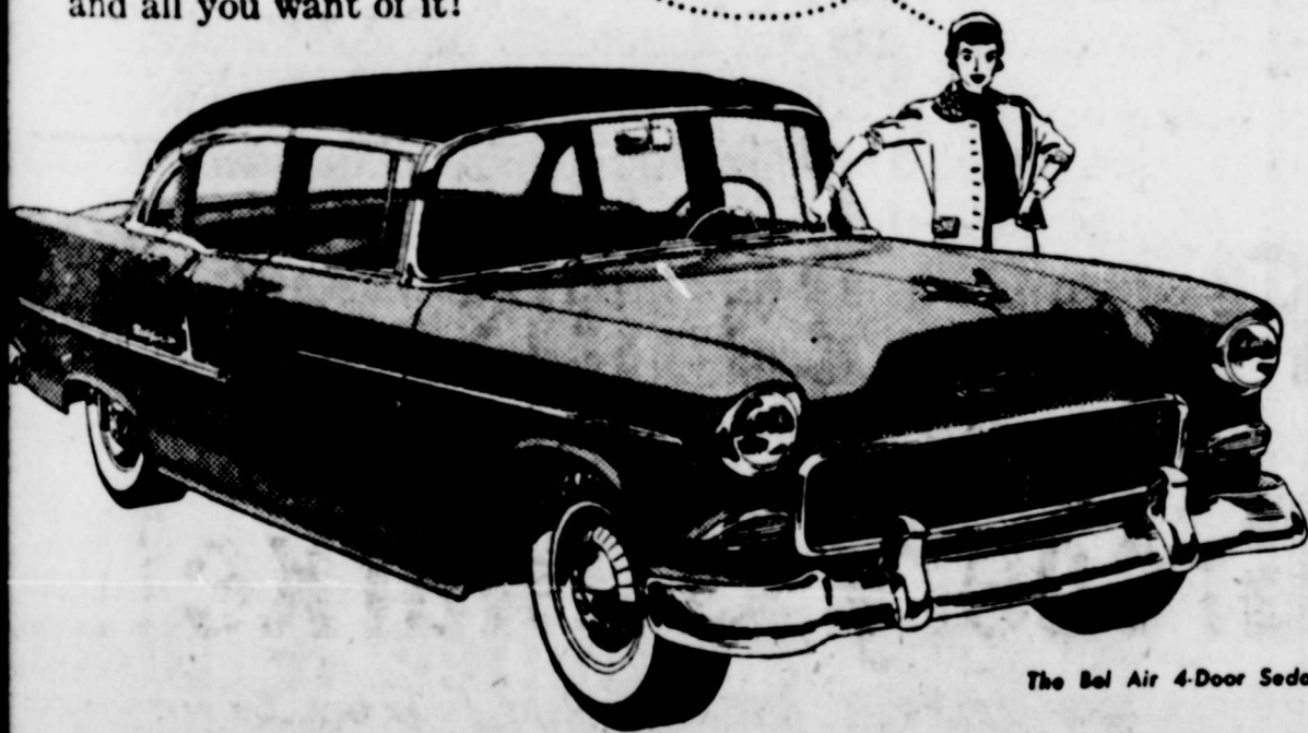
The Bel Air 4-Door Sedan.

This is just one of the exciting discoveries you'll make when you drive the Motoramic Chevrolet! Come in and see.