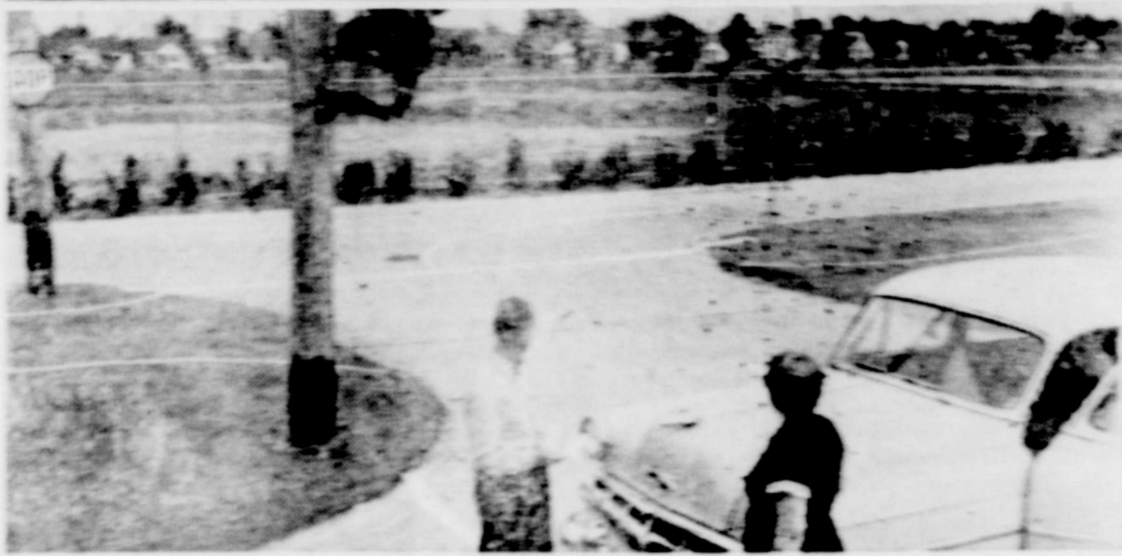
Mass layouts for driving schools are urged by high school students to combat traffic accidents. Education was named most effective in a nationwide poll sponsored by the Chevrolet Motor Division.