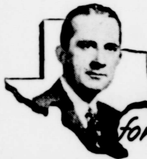
Texas comes first with Allan Shivers

The money went for other—but mighty important—things too, like school buses and cafeterias with hot noontime lunches. It meant more vocational help for your child. It went for many things, all necessary for a better education for him.