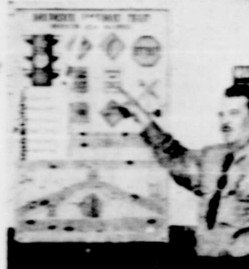
Periodic driver physical and mental tests drew support from youngsters.

rays and barnacles, which they are easily able to capture under ordinary circumstances.