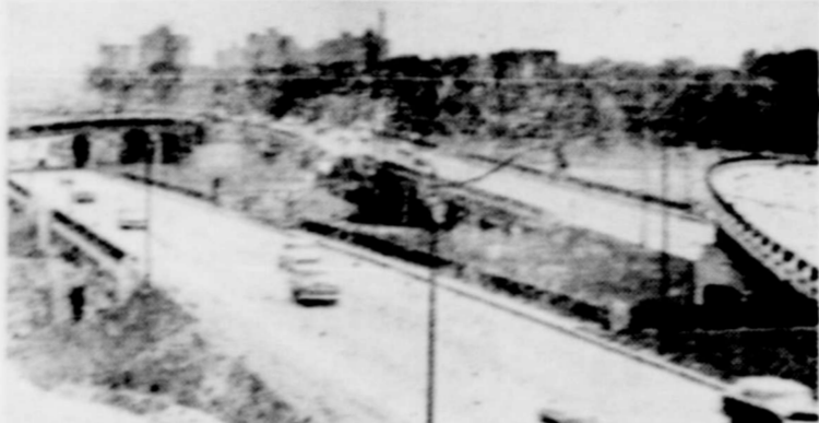
Expressways like this were ranked by 12 cities below such remedies as periodic driver physical and mental tests for support from youngsters.