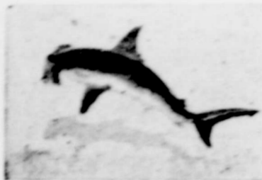
HAMMERHEAD SHARK

Superficially this animal might look a bit like a shark carrying a bone horizontally in its mouth. Except for the head the lines of the animal are much like one would recognize as being the general average for sharks.