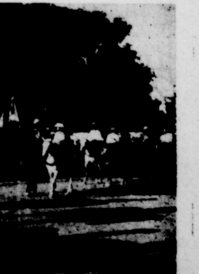
HERE COMES THE PARADE—showing a portion of the riders who took part in the opening day parade. It might also be pointed out that Rankin has a few trees to brag about also.