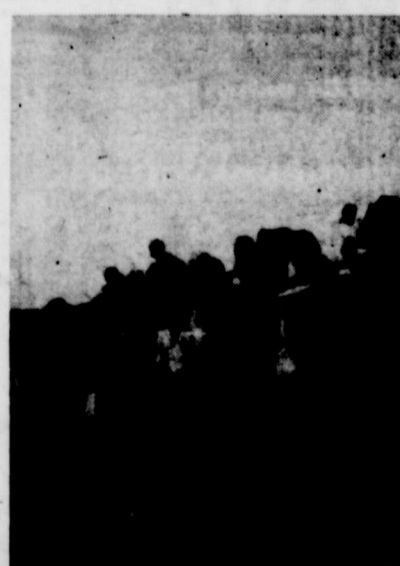
OVERFLOWING AND THE SHOW HASN'T EVEN STARTED—might be a good title for this picture of the over-taxed grandstand at the recent Kid Rodeo. If the show is to grow there will be a great need for more seating.