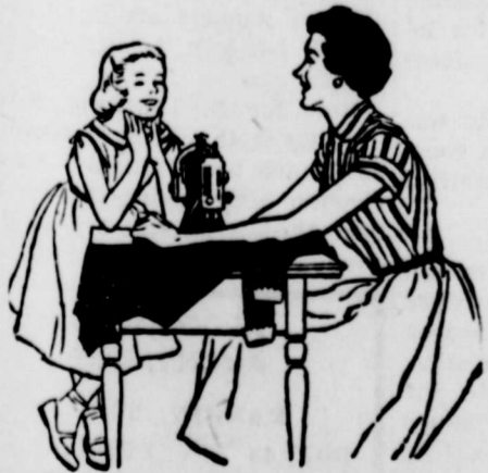
She's cooking dinner—her automatic electric range has "put it on."

* DO TWO THINGS AT ONCE WHEN YOU LIVE ELECTRICALLY!