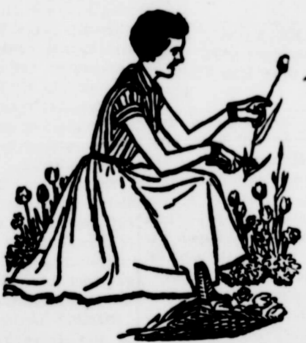
She's doing the laundry—her automatic electric washer and dryer have taken charge.

* DO TWO THINGS AT ONCE WHEN YOU LIVE ELECTRICALLY!