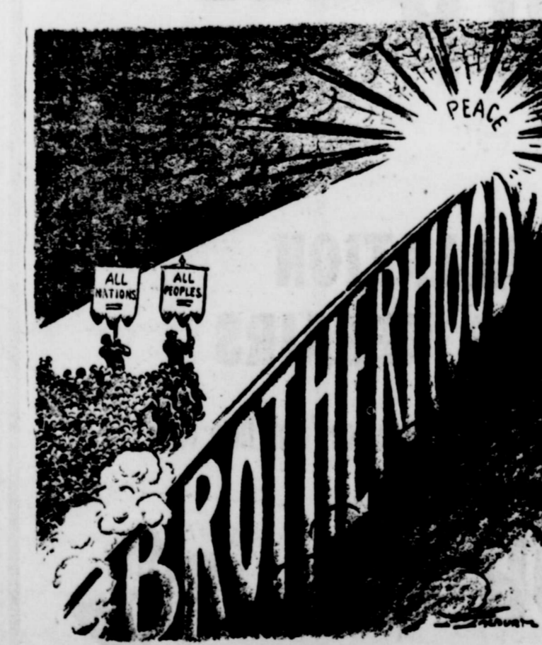
BROTHERHOOD WEEK February 21-28 Sponsored by The National Conference of Christians and Jews