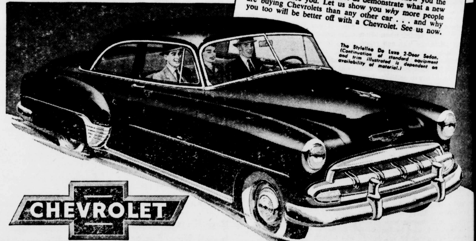
The Styling De Luxe 2-Door Sedan. (Continuation of standard equipment availability of material.)

A few minutes in our showroom now may save you some real money. So come in soon. Let us show you the kind of deal you can get. Let us demonstrate what a new Chevrolet offers you. Let us show you why more people are buying Chevrolets than any other car . . . and why you too will be better off with a Chevrolet. See us now.