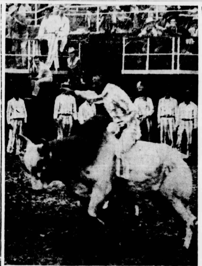
SECURE IN HIS SEAT, the convict rider is content to let the bull have his head until the whistle blows completing their 8-second battle. After that it's every man for himself. Top riding and spine chilling thrills will be provided by convicts during the four performances of the 21st Annual Prison Rodeo, October 5, 12, 19 and 26 at Huntsville, Texas.

The K-310, Chrysler Corporation's experimental sports sedan, will be on display in the Automobile Building at the State Fair of Texas in Dallas October 4 through October 19. The K-310 is one of the features of the new $1,000,000 "New Worlds in Engineering" show explaining how the American automobile is designed.