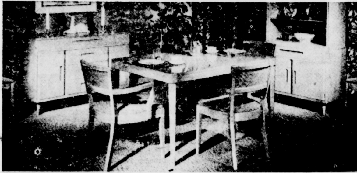
BUDGET-FITTING DINING SUITE —Simplicity, lots of storage space, and design to fit any size room and budget feature this new dining room suite. The buffet has linen and silver compartments in addition to ample storage space and drawers. The china cabinet has sliding glass doors to protect and display your finest china. Finger-tip pulls are a result of the designer's desire to achieve the "easy-to-live" furniture.

This designers are offering Texas homemakers the opportunity to express themselves in furnishings with originality.