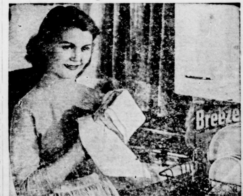
The average housewife in 30 years of marriage faces a stack of dishes twice as high as the Empire State building. Experts say the work can be simplified by careful planning and efficient operation. One labor saver is new All-Purpose Breeze, now being introduced in this area. Product features a Cannon dish towel in economy size package, pastel face cloth in large size.