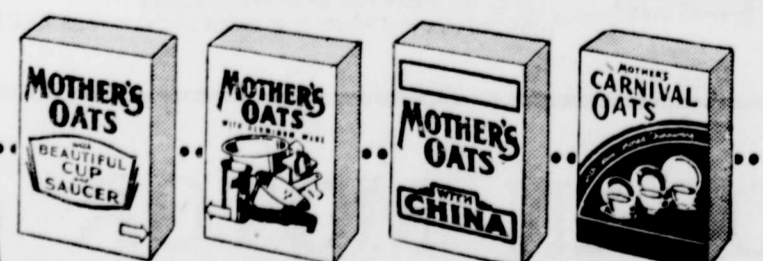
Products of The Quaker Oats Company

Mother's Oats offers you all-purpose selection of DINNERWARE and ALUMINUM KITCHEN UTENSILS