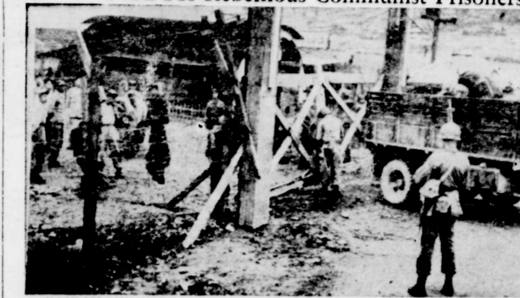
KOJE ISLAND, KOREA—A U. S. Army truck is backed up to a gate of Compound 76 to deliver food to the rebellious Communist prisoners, some of whom may be seen behind the wire in left background. Truck does not enter the Compound, but unloads supplies at the gate. They are carried inside by the prisoners who do their own cooking.