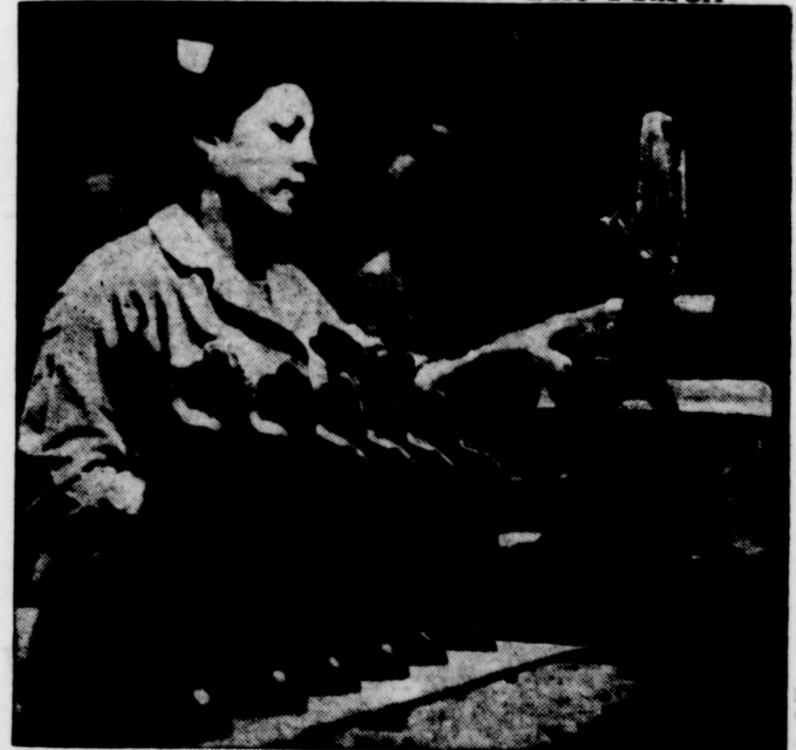
HEADIN' HOME! Chocolate bunnies are on their way to millions of waiting kids across the nation.

New York, N. Y. — The Easter Parade is really under way! Chocolate Easter bunnies by the millions are on the march! As a matter of fact, they have been marching since mid-November. And the kids will see them Easter Sunday after the Easter Bunny has made his annual tour.