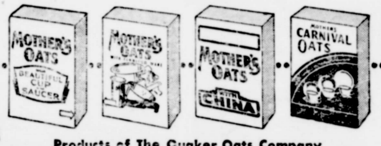
Products of The Quaker Oats Company

Mother's Oats offers you all-purpose selection of DINNERWARE and ALUMINUM KITCHEN UTENSILS