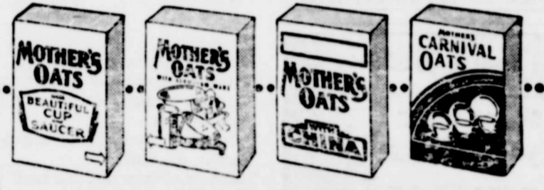
Products of The Quaker Oats Company

Mother's Oats offers you all-purpose selection of DINNERWARE and ALUMINUM KITCHEN UTENSILS