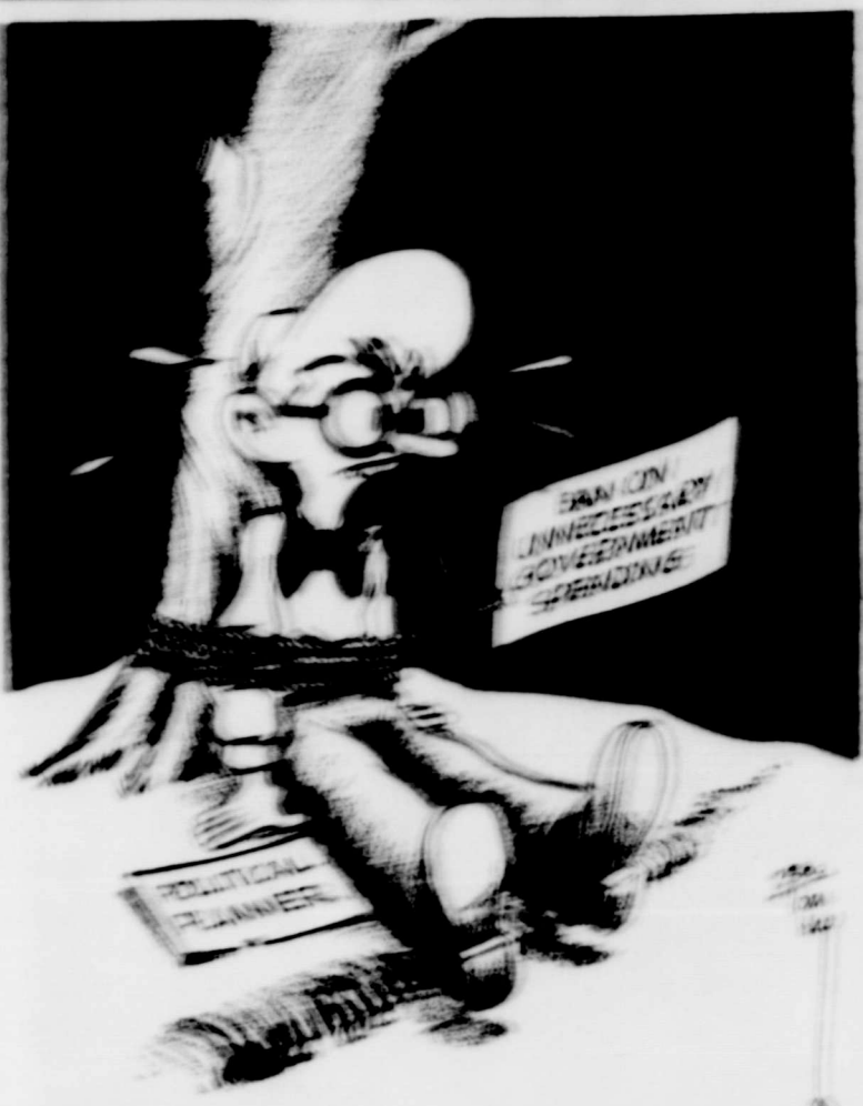
The One and Only Needed Control