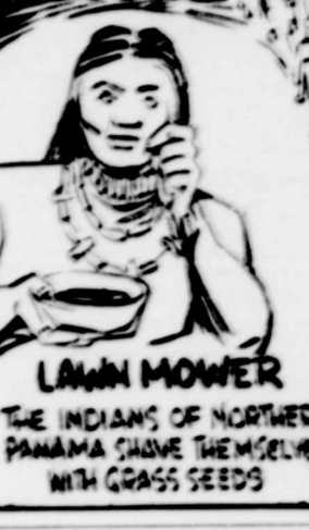
LAWN MOWER THE INDIANS OF NORTHERN PANAMA SHAVE THEMSELVES WITH GRASS SEEDS