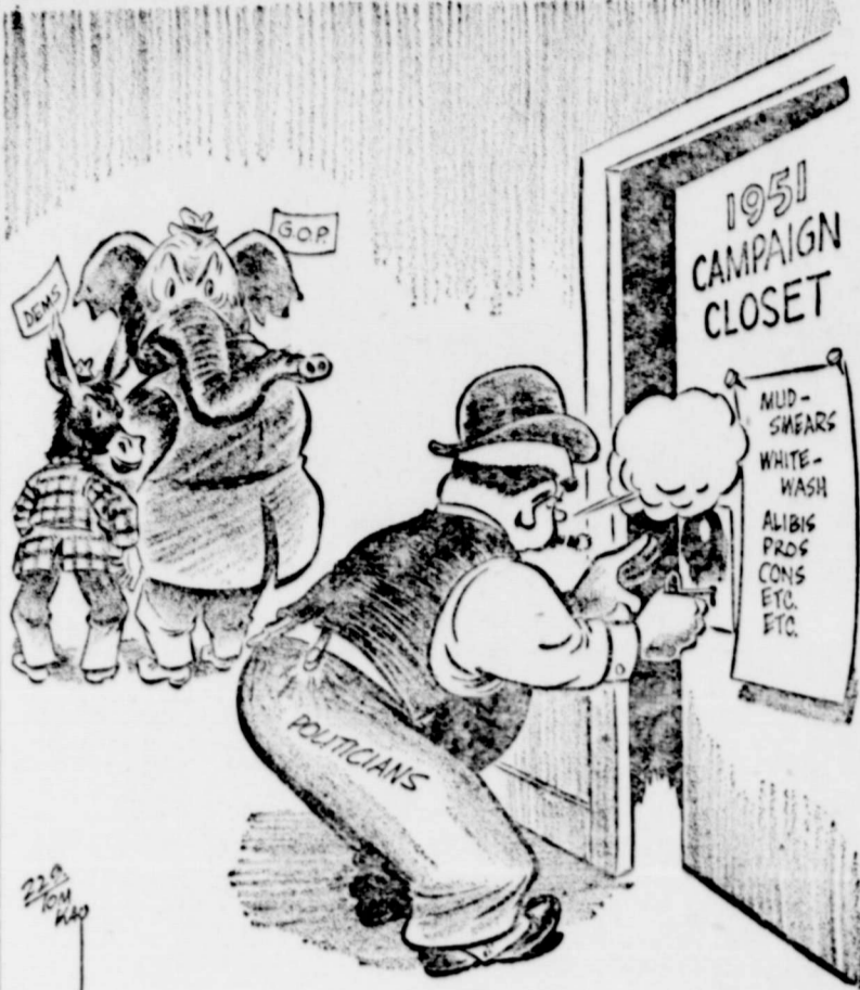
Here We Go Again!