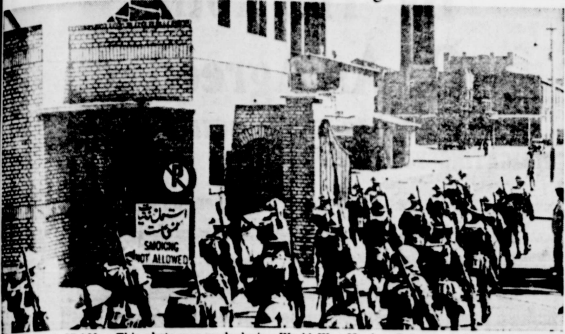
TEHRAN, IRAN—This photo was made during World War II when Britain put Indian troops into Iranian oil fields and plants as a security measure to guard the vital "Black Gold." Recently the Iranian Parliament approved a proposal to nationalize the Anglo-Iranian Oil Company, controlled by the British government. Russia always has made a covetous eye on Iranian Oil and if the cold war ever became hot, it would be a big prize. The British government has protested the nationalization proposal.