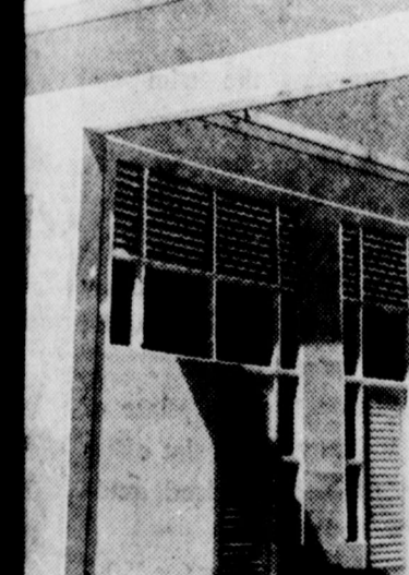
Thousands of persons from all over the world are expected this year to visit the International Exposition at Port-au-Prince, Haiti, to commemorate the two hundredth anniversary of the founding of that city. The exposition features a special United Nations exhibition, dramatizing the activities of the world organization. Above is one of the U.N. pavilions under construction in the Haitian capital.