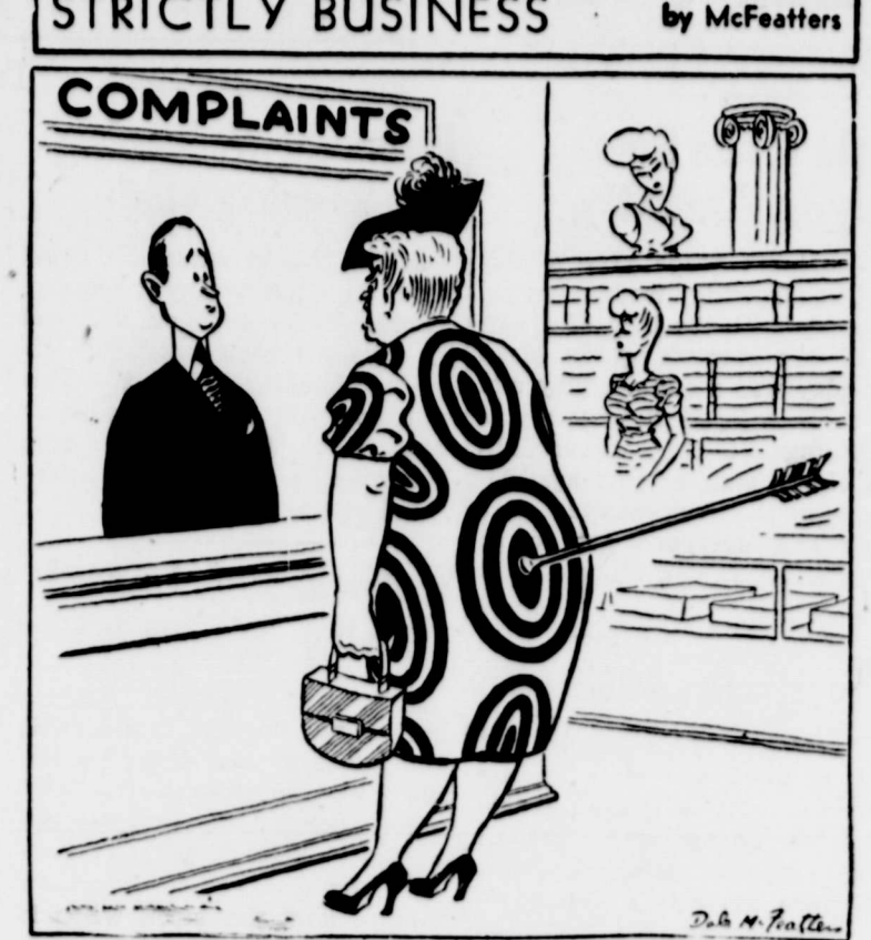
"I want to register a complaint regarding the toy department!"

performed such an operation on herself in a split second with a her hip to replace bone in her