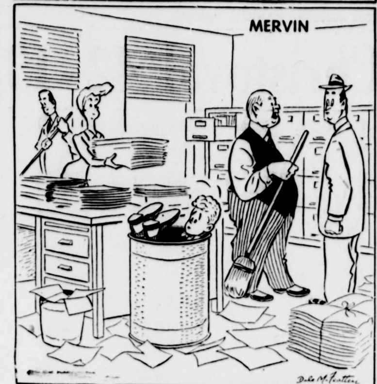
"We're just cleaning out things we don't want any more!"

War. The site of Gen. Paso will observe the day with spectacular fireworks display sheep near El Paso High School stadi-