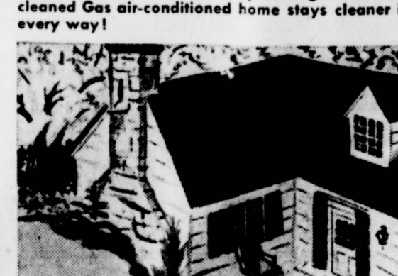
8. Here's one of the hundreds of homes which have enjoyed Gas air-conditioning for more than 4 years, with unanimous approval!