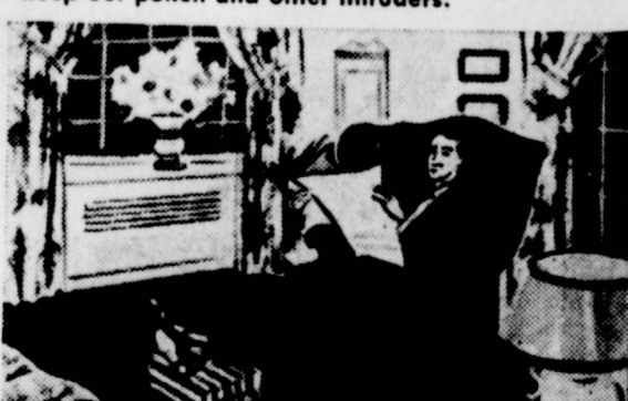
9. Here's your home . . . fitted with an economical, right-for-your-own-size house Gas air-conditioning unit. Ah—h-h!