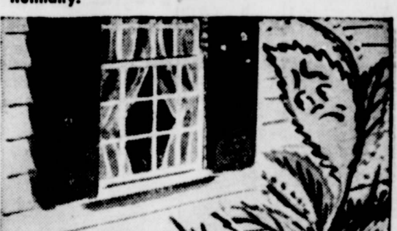
6. Here's the ragweed which will never disturb your sleep again. Filtered air and tight-closed windows