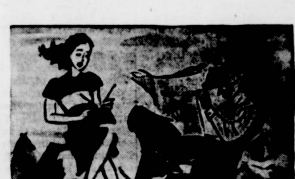
oning keeps it cool, fresh, free from sticky