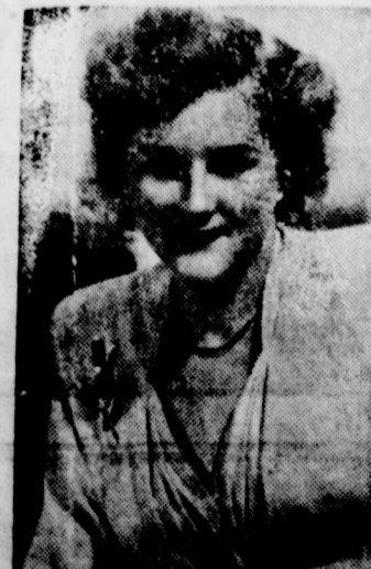
CAUSE CELEBRE — Margaret Whiting has reason to celebrate. The singer, who recently observed her 22nd birthday, is now star in NBC's "Philip Morris Frolics."