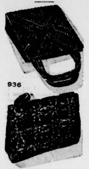
SO YOU want a Corde bag! Too expensive to buy? Then cro-chet either of the beauties pictured—inexpensive and easy to do.

Rich Corde bags crocheted in squares or riangles. Pattern 936 contains directions or purses; stitches; list of materials. Due to an unusually large demand and current war conditions, slightly more time is required in filling orders for a few of the most popular pattern numbers. Send your order to: