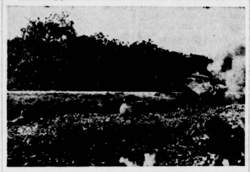
U. S. Doughboy is shown knocking out Nazi