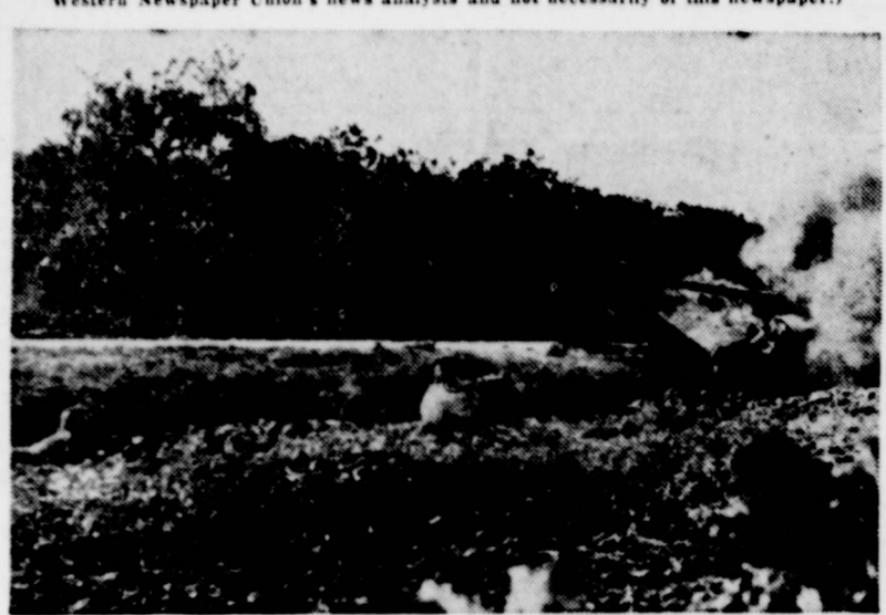
U. S. Doughboy is shown knocking out Nazi tank with bazooka og western front.

(EDITOR'S NOTE: When opinions are expressed in these columns, they are those of Western Newspaper Union's news analysis and not necessarily of this newspaper.)