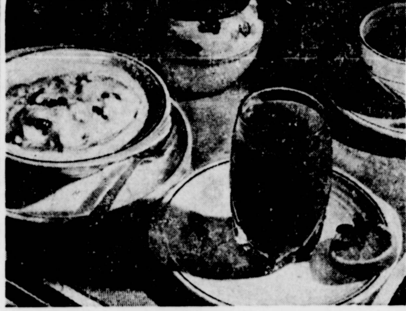
Cheery Beginners for That Morning Starter