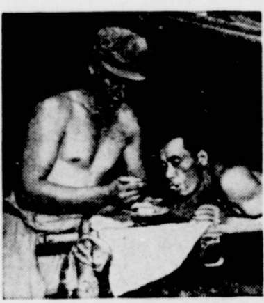
Yank Feeds Wounded Jap.

To the west of Hollandia, army fliers pounded at Jap installations