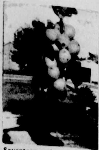
Seventeen apricots in one cluster on a tree belonging to Howard Stavley are pictured above. Stavley stated that his trees were loaded with fruit this year, but on lower limbs only, and in clusters like grapes and those pictured above.