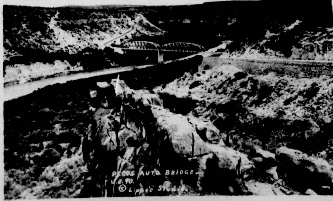
PECOS AUTO BRIDGE U.S. 90

Geeslin Funeral Home in Alpine was in charge of the arrangements for the funeral services.