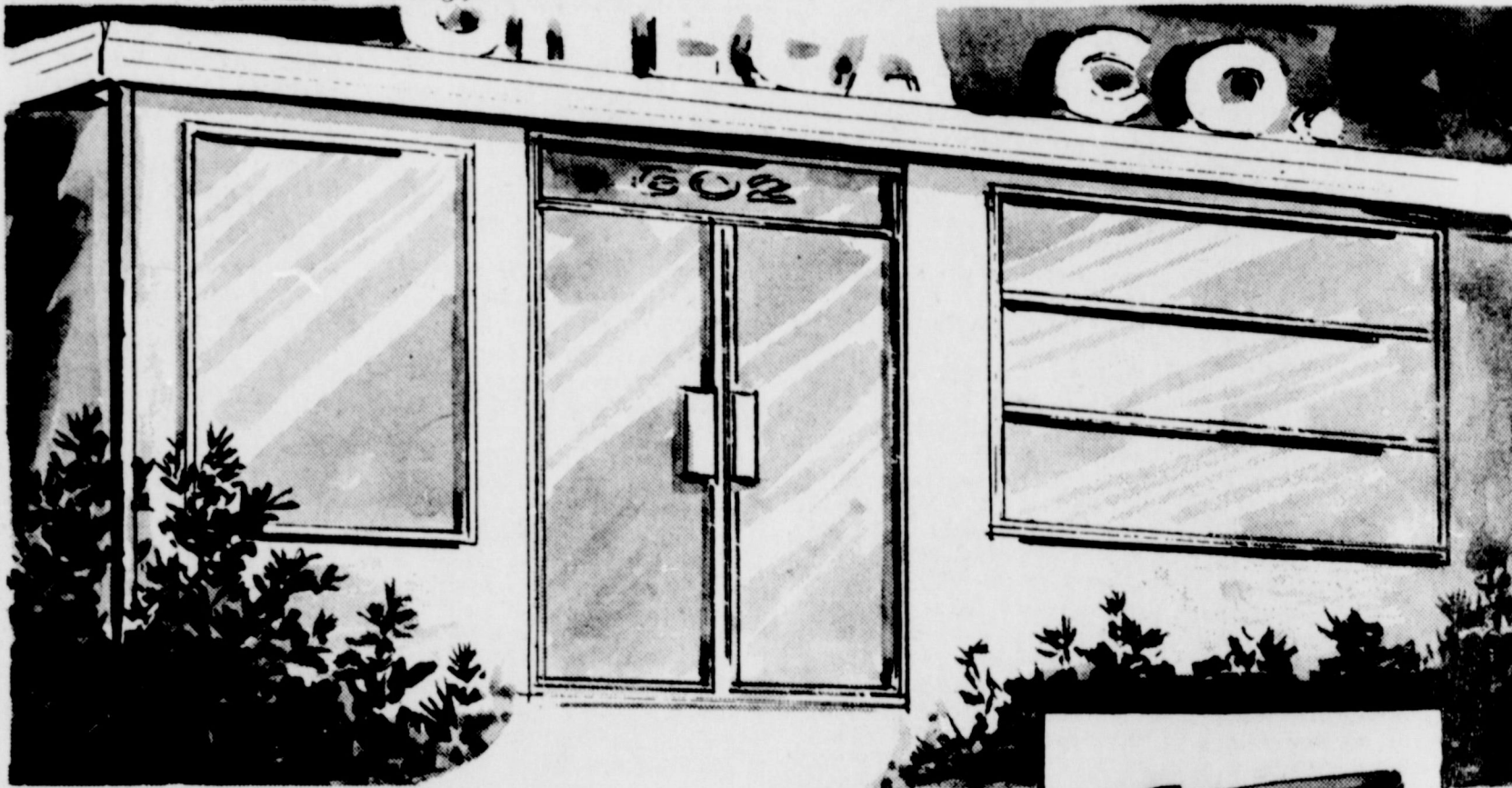
Bride's Books at The Times