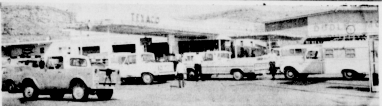
Our annual pictures showing the significance of deer hunting to local businesses - a scene above in the drive of a local service station, and at right - not an unusual type of rig seen going through last Friday. The motor home is pulling the jeep.

Miss Brenda Carter was in Houston last week for a medical check-up.