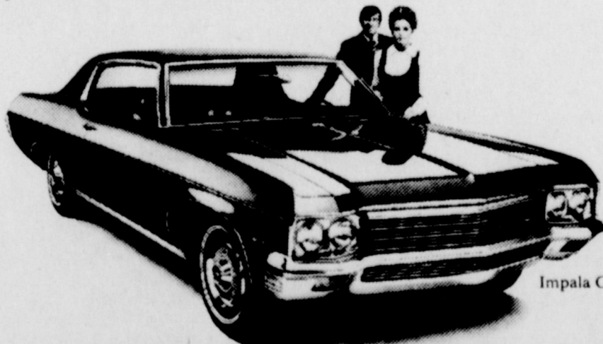
Impala Custom Coupe