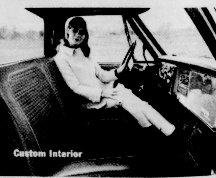
An inside as soft as the outside is tough.