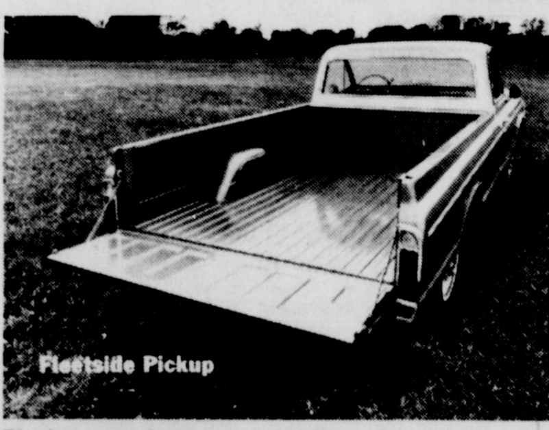
The lowest priced popular pickup with an 8-foot box.