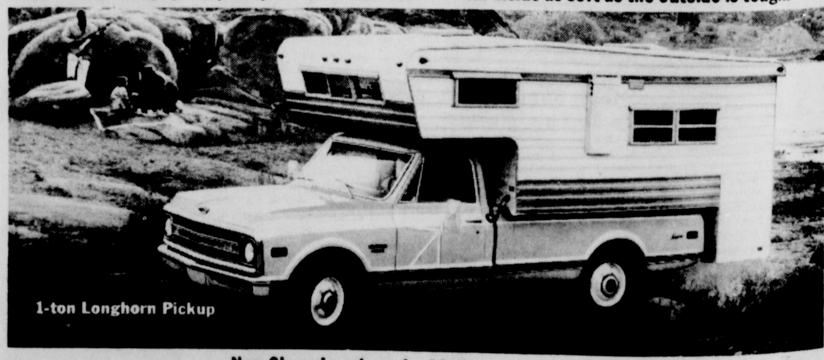
New Chevy Longhorn for biggest camper bodies.

Only a Chevrolet pickup can tally this list of advantages that add up to more value for your investment: