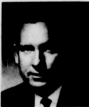
Pete Snelson Nominee for State Senator, 25th District