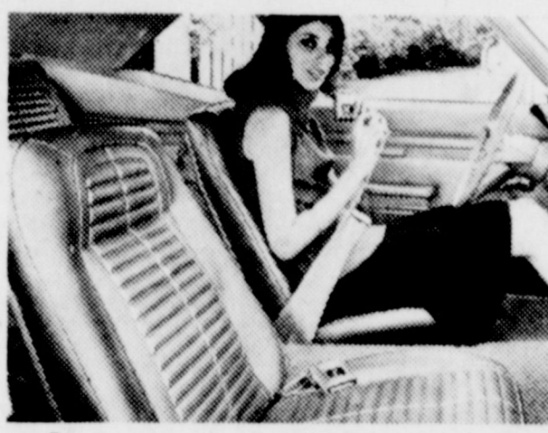
Pontiac interiors make you glad you left home - soft Morrokide and simulated wood trim so real only a termite can tell it isn't.