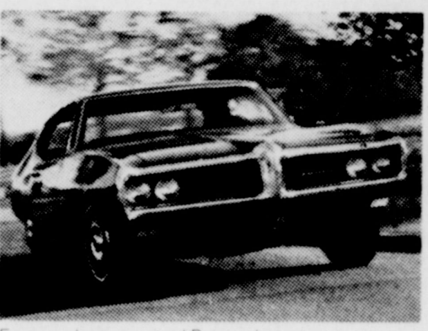
Even our lowest priced Pontiac has a unique 175-hp Overhead Cam Six. Unless you count cylinders, you'll swear it's a V-8.