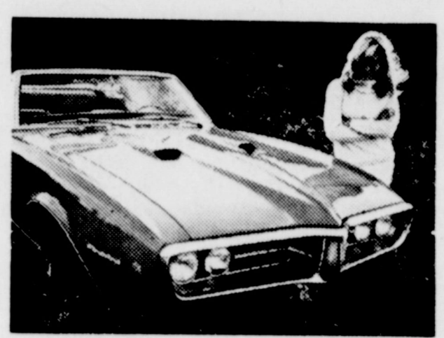
Only Pontiacs have Wide-Track. Drive a Pontiac and you'll wonder who took all the bumps and curves out of the road.

(And what makes ordinary cars ordinary?)