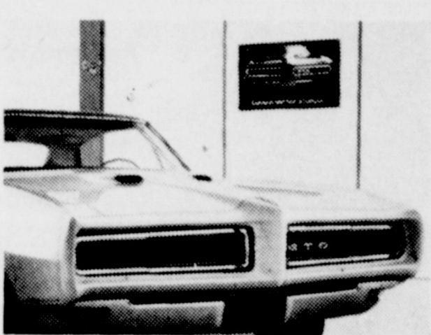
Innovations like GTO's Bumper of the Year make Pontiacs look expensive. But record sales prove we know how to price them, too.