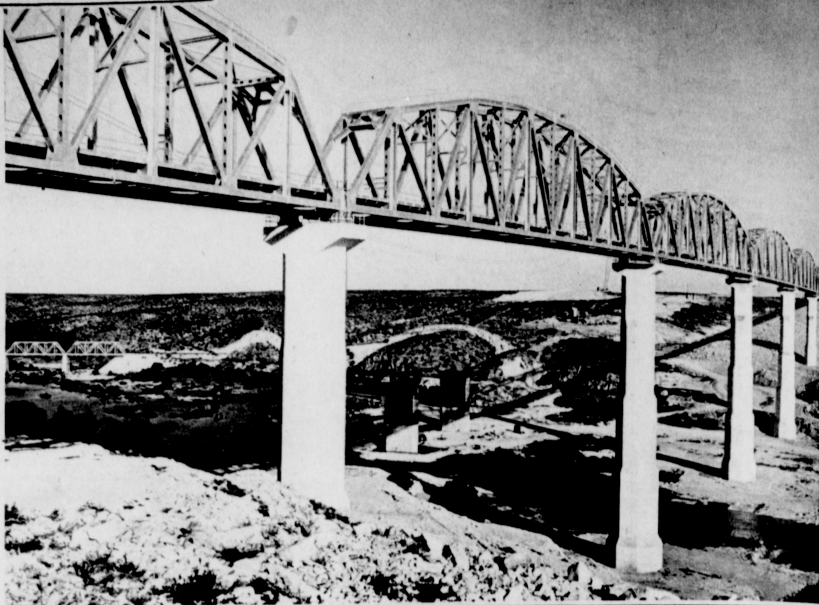
The tracks of this new $5,000,000 Southern Pacific Railroad bridge across Devil's River near Del Rio tower 235 feet above the stream bed, but will be only 40 feet above the water surface when Amistad Reservoir fills after completion this year. First two piers of the new U.S. Highway 90 West bridge can be seen at center under railroad bridge span, and old Southern Pacific bridge, left background, will be covered by 100 feet of water.