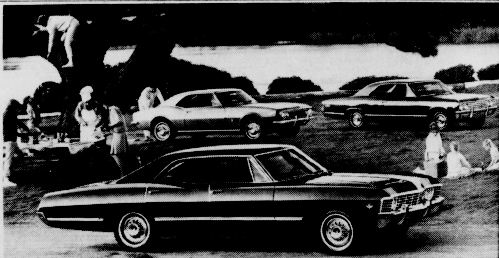
Foreground, Impala Sport Sedan. Background, Camaro Sport Coupe and the Chevelle Malibu Sport Coupe.