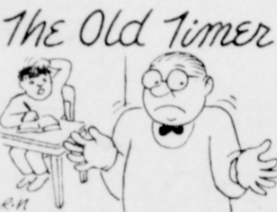
"The new math may produce more problems than it solves."