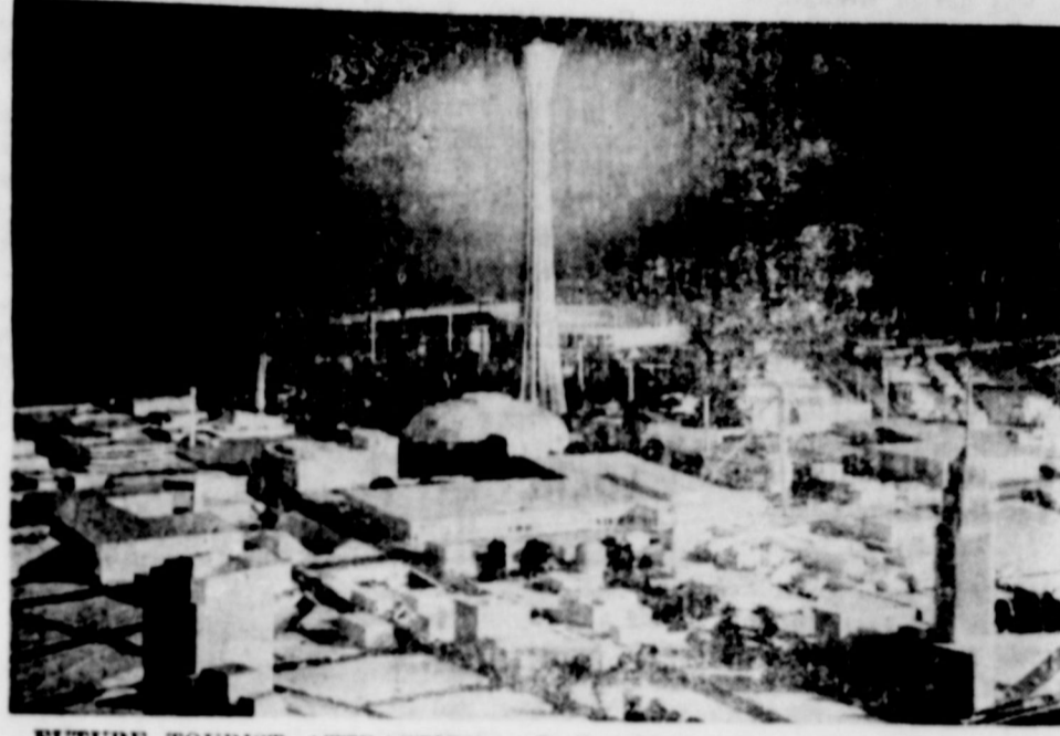
FUTURE TOURIST ATTRACTION — Preliminary model of HemisFair 1968 shows how the 90-acre site in downtown San Antonio would look for the first major international exposition in the history of the Southwest. Located two blocks from the Alamo, the proposed scale model is dominated by a 70-story tower and a civic center complex that would include an arena and fine arts theater. Theme of the fair, scheduled for 184 days in mid-1968, will be a centuries-deep probe into the varying cultures of the family of Americas.