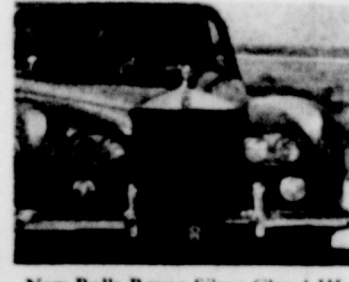
New Rolls-Royce Silver Cloud III

Quiet Means Quality . . . Since quiet is a traditional measure of car quality, Ford engineers designed the '65 Ford for maximum quietness. To illustrate