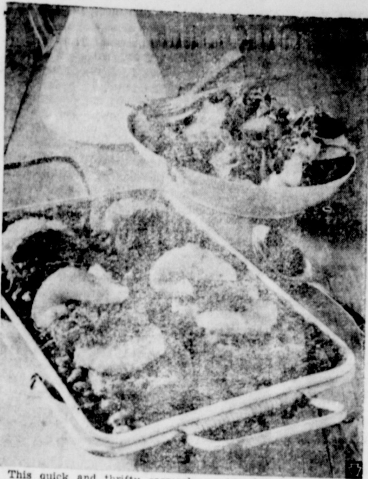
This quick and thrifty casserole combines handsome canned pineapple slices with baked beans and corned beef hash. Many budget minded homemakers regularly stock cans of these popular items in their pantry. This supper favorite goes together in less than half an hour. Plan it on a menu with tossed green salad and hot rolls.