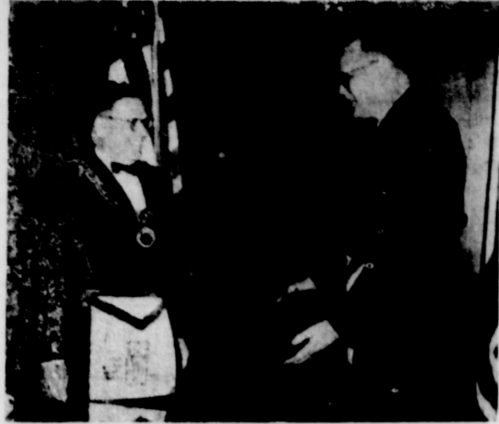
PANHANDLE RANCHER HEADS QUARTER MILLION MASONS