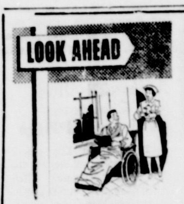
MONEY HELPS ON THE ROAD TO RECOVERY ...

Accident and Health Insurance provides the money you need to assure proper care during illness, injury, convalescence. And the cost is low. See us for details. No obligation.