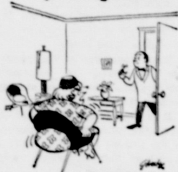
"Help!" The Old Timer

"You can tell some fellows aren't afraid of work by the way they fight it."