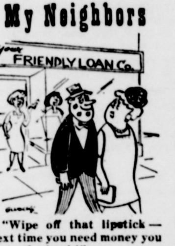
next time you need money you go to the bank!"