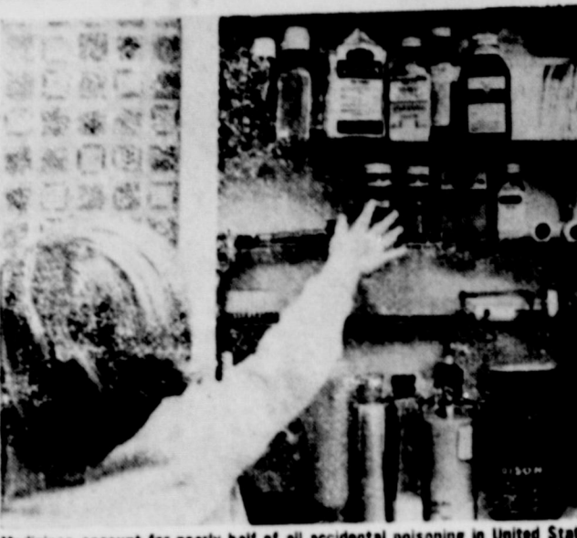
each year. Discard unused medicine and keep rest out of children's reach

food containers or soft drink gested: bottles. A toddler just naturally assumes that a soft drink bottle contains a treat. He'll drink whatever he finds in it. "The facts are clear," warned. "Between 65 and 70