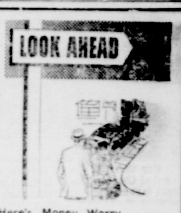
Here's Money Worry you can drive away

Repair bills, medical expenses, liabilities - all these can cost you if you run into trouble. Don't run the risk . . . see us for adequate auto insurance protection at low cost.