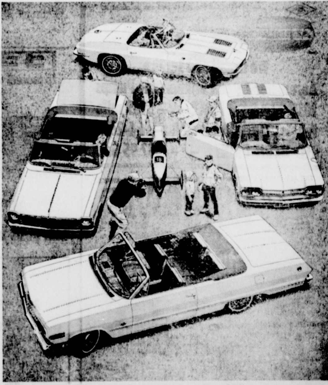
Models shown clockwise: Corvette Sting Ray Convertible, Corvair Monza Spyder Convertible, Chevrolet Impala Super Sport Convertible, Chevy II Nova 400 Super Sport Convertible. Center: Soap Box Derby Racer, built by All-American boys.

NOW SEE WHAT'S NEW AT YOUR CHEVROLET DEALER'S