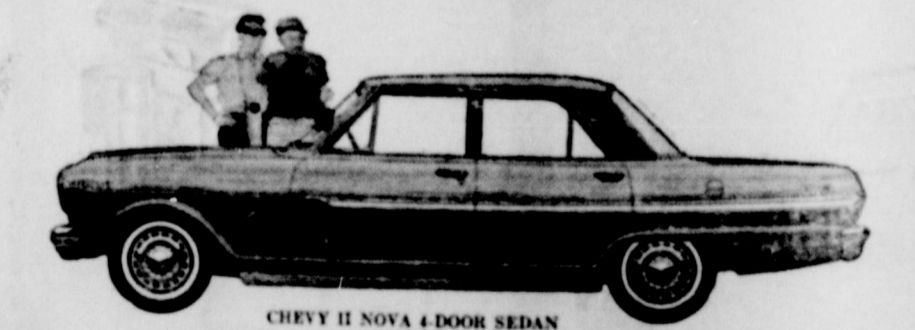
CHEVY II NOVA 4-DOOR SEDAN