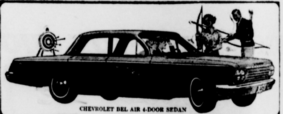
CHEVROLET BEL AIR 4-DOOR SEDAN

...for a once-a-year buy on just the one you want!