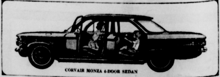
CORVAIRE MONZA 4-DOOR SEDAN

Getting ready for a vacation trip couldn't be easier: just pick a Chevrolet, pack your family and go. And that first part is easiest of all with what your Chevrolet dealer has to pick from. The Jet-smooth Chevrolet, America's favorite family car, with a ride that only seems expensive; the Chevy II, about as lively and luxurious as you can get for a low, low price; the sporty Corvaire, a rear-engine beauty that just refuses to be run-of-the-mill. One of these 4-doors (or a two-door for that matter) is sure to fit your family and budget just fine. So—okay—what are you waiting for?